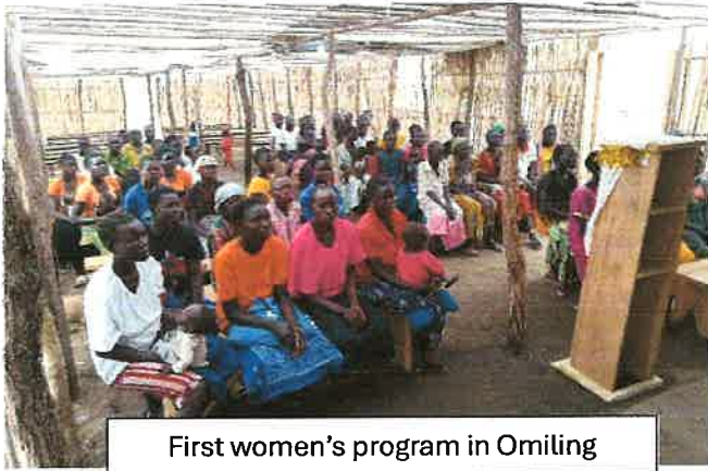
First women's program in Omiling

5 years of their early independence were marked by civil war. Many lives were lost and it makes ministry very difficult to do during wartime.