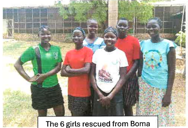
The 6 girls rescued from Boma